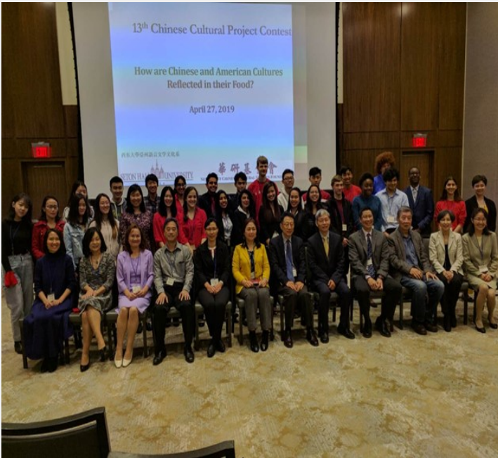
Chinese program in conjunction with NJCCSF organized The 13th Chinese Cultural Project Contest. It was held on April 27 in