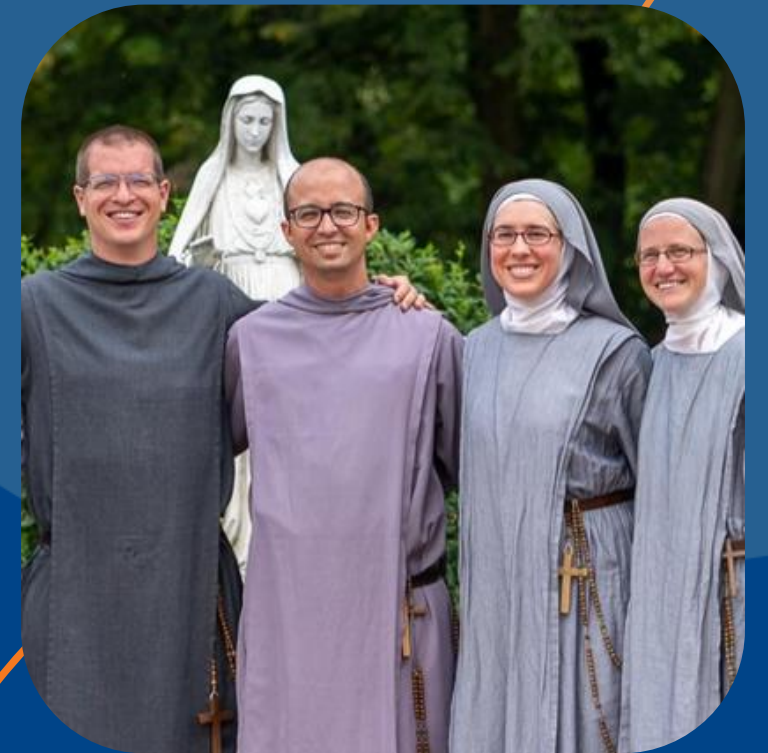
The Community of St. John (CSJ)