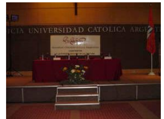
Universidad Catolica Argentina, Buenos Aires, Argentina

Universidad Catolica Argentina October 2-4, 2006 For more information please see PDF...<u>click here</u>