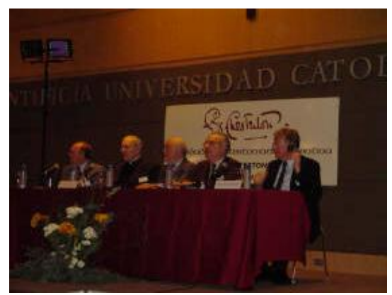
Opening of the Conference