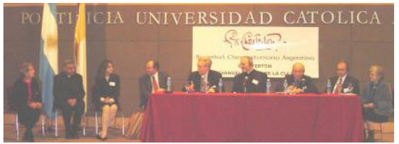
Panel Discussion at the Catholic University of Argentina Buenos Aires, Argentina

Universidad Catolica de Argentina Buenos Aires, Argentina