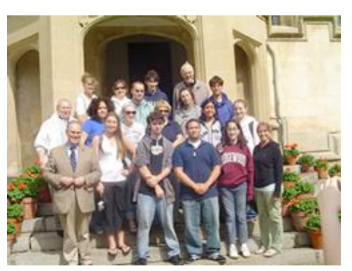
Oxford, July 2007

June 23 - July 8, 2007 For more information please see PDF...<u>click here</u>