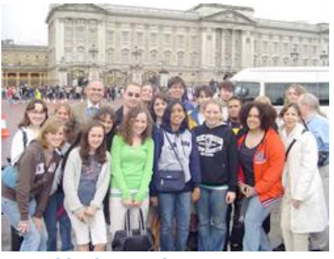
Buckingham Palace, June 2007