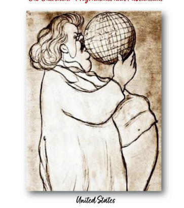
Argentina | Australia | Austria | Brazil | Canada | Chile | China | Colombia | Korca | Creatia | France | Germany | India | Italy | Ireland | Lebanon | Matta | Mauritus | Mexico | Norway | New Zealand | Peru | Philippines | Portugal | Poland | Sweden | South Africa | Spain | UK | United Arab Emirates