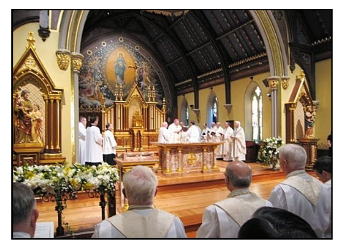
Priest Community at the dedication of the Chapel's new altar.

A walk across campus provides concrete reminders of the priests who served here: from McQuaid (Continued on page 3)