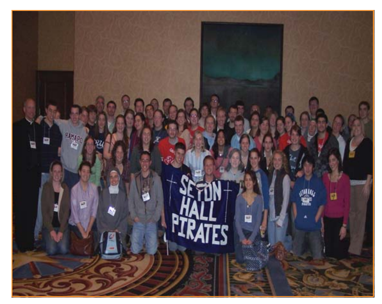
The largest group ever for the Focus Leadership Conference from Seton Hall attended the meeting at Dallas in January.