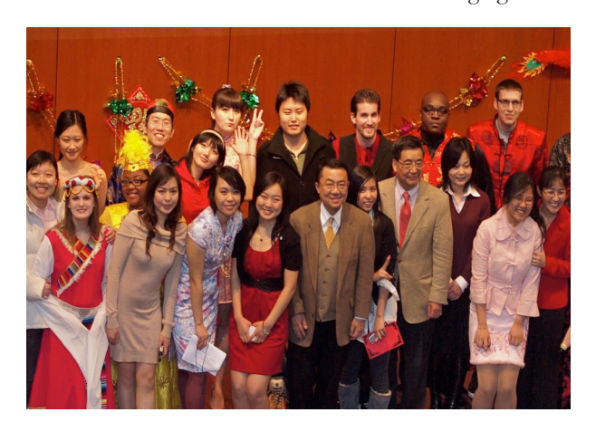
CHINA NIGHT 2010