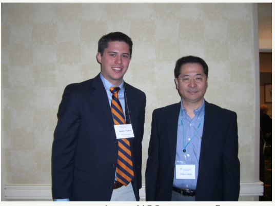
ANNUAL AAS CONFERENCE IN PHILADELPHIA