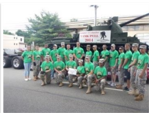
Cadets of Pirate Battalion and Rutgers Army ROTC in front of the 80,000 pound tank they pulled.

This past summer, Pirate Battalion supported the Knights of Columbus Tank Pull in Clifton, New Jersey in order to support the Wounded Warrior Program. Cadets of the Pirate Battalion teamed up with our neighbors, the Scarlet Knights of Rutgers Army ROTC. They created a team that was sponsored by Capstone Valuation Services, LLC. Cadets assisted with set up and breakdown of the site. The Tank Pull Challenge itself was a physical test of endurance in which competitors moved