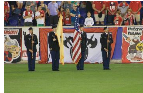
The color Guard Team presents the colors at a New York Red Bulls game early in the semester

semester in which all cadets were welcome to try out and display their knowledge of being a color guard. The Team practices twice a week to maintain high professionalism and skills.