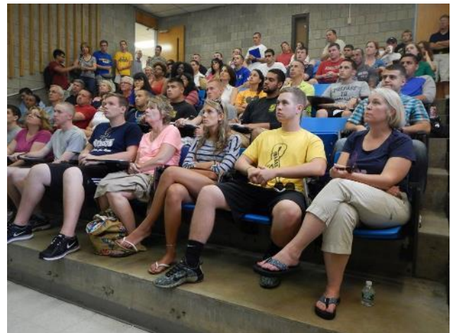
Prospective Cadets attend an informational session held by Pirate Battalion during NCO Week