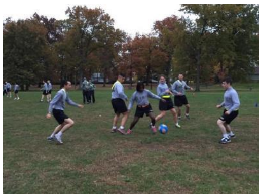
Cadets play soccer in late October at Ivy Hill Park

One of the First tasks that Pirate Battalion Cadet Leadership undertakes during the Start of any Semester is overseeing and improving Battalion Physical Readiness. Using Physical Training plans developed by MSIII cadets with Guidance from their MSIV platoon leaders Cadets lead their subordinates every week in conducting Physical Readiness Training. Through the Semester Pirates would conduct runs in South Orange, Army regulation exercises on Seton Hall Campus, and once every month complete events.