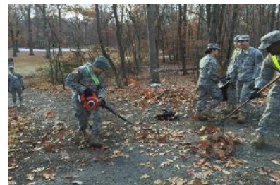
Cadets move leaves out of a SMR public use area

Thanks to Essex County and the Parks Department, Pirate Battalion enjoys the use of South Mountain Reservation to conduct its training. To show appreciation and dedication to the community, Cadets picked up trash and cleared sidewalk of debris and well as cleaned up the Reservations 9/11 memorial on November 15 th 2014.