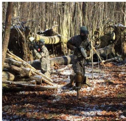
Pirates shoot and move during a Squad Attack at Battle Creek Paintball

On November 14 th 2014, Pirate Battalion deployed to Battle Creek Paintball facility to conduct Squad STX lanes utilizing Paintball equipment to help better simulate actual combat conditions. Cadet Squad leaders were tested in their ability to brief operations orders as well as direct their squad to complete their mission while under enemy fire. After three iterations of STX lanes, the squads faced off against each other in a force-on-force tournament. Cadets said they gained invaluable insight into the complexity of commanding soldiers under fire and the importance of effective communication in leading their teams and squads.