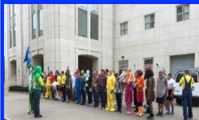
Alpha Company prepares to step off in costume

The Friday of Halloween every year Alpha Company shows out in force in costume for Halloween. This year, the Battalion ran through South Orange and back to Seton Hall showing Pirate pride and Camaraderie.