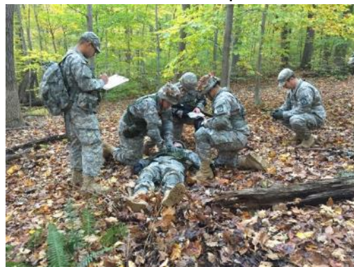
3 rd Platoon Cadets search an "Enemy" during Squad STX on October 25th

LTX After a full night's sleep, Alpha Company woke up and conducted squad STX lanes, testing their ability to not only receive and understand an operations order, but also communicate the mission to their squad and lead them. After two full days of continuous training, Pirate Battalion moved back to FOB SHU and dismissed for the remainder of that weekend.