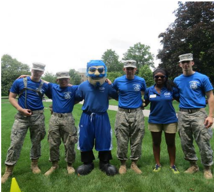
Cadets with the Seton Hall mascot at Pirate Adventure!

Over the summer, many of the Battalion's Pirates had great opportunities for participation in additional training. Training consisted of programs such as Cadet Troop Leader Training (CLT), Project Go, Cultural Understanding and Language Proficiency (CULP), and Leadership Training Course (LTC) as both a trainee and Cadre to assist in training of new cadets. Cadets also have the opportunity to attend army schools such as Airborne School and Air Assault School. However, while some cadets were away for the summer, many of the remaining Pirates participated in events at Seton Hall University as well as the neighboring communities. Pirates provided support to home events such as Pirate Adventure, Seton Hall University's Freshman Orientation event, the Knights of Columbus Tank Pull, and several color guards. One color guard in particular stood out in which the Pirates conducted a color guard on the Aircraft Carrier Intrepid in New York City. All the summer events allowed Cadets of the Pirate Battalion continuity of training received during the school year as well as continuous leadership experience to facilitate excellence in our cadets.