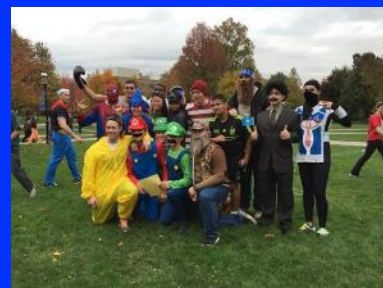
The MSI class after the run

The Friday of Halloween every year Alpha Company shows out in force in costume for Halloween. This year, the Battalion ran through South Orange and back to Seton Hall showing Pirate pride and Camaraderie.