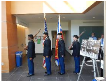
The team during an Alumni event

Throughout the year, Pirate Battalion supports several various events by tasking the Color Guard Team to present the United States Colors. Pirates have served as color Guards at locations such as the Aircraft Carrier Intrepid, New York Red Bulls games, at the Prudential