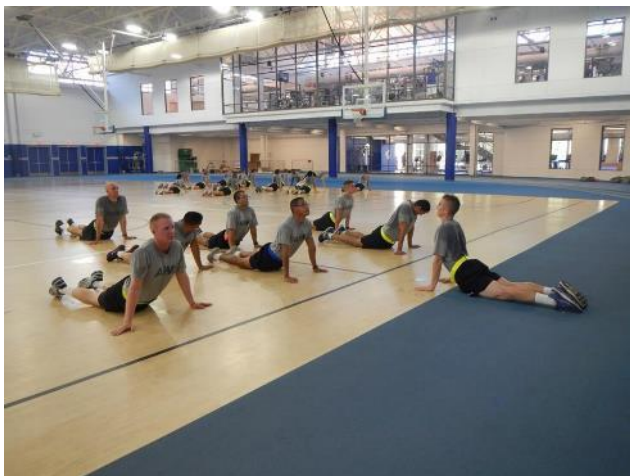
MSIII Cadets lead Physical Readiness Training during NCO Week

Pirate Battalion Started off the fall semester strong with NCO week, run by the Battalions Cadet NCO leadership. Focusing on bringing Alpha Company's teams, squads, and platoons together. After NCO week, more training will start with the Battalion Color Guard team, Physical Training, Ranger Challenge, the Combat Water Survival Test, two leadership Labs and the Battalions Fall Leadership Training Exercise (LTX). More details can be read on page 6.