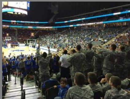
Cadets put their hands up to help psych Mercer out during a free throw

On November 16 th Seton Hall Men's Basketball opened its season against Mercer. Pirate Battalion was there to lend support. Alpha company sat in the students' section cheering on the Pirates to their first win of the season.