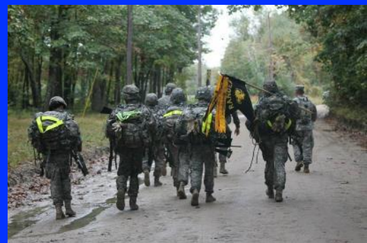
The team during movement between events

complete the challenge! The Ranger Challenge Team competed in events such as a 10k ruck march, an obstacle course, confidence course, a hand grenade assault course, one rope bridge, a log carry, and an unknown event of the Commander's choice called the CDRs Challenge.