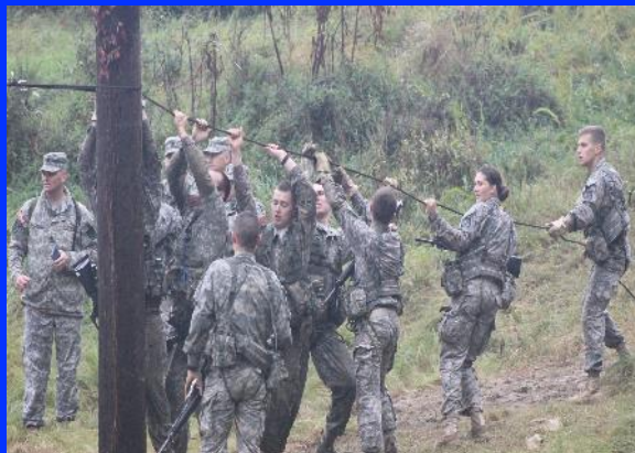
The 2014 Ranger Challenge Team assembles their one rope bridge during the Competition

The Ranger Challenge competition was held on 18OCT2014 in Dix, New Jersey. This year, ranger challenge candidates underwent rigorous training beginning in the 2014Spring semester in order to physically and mentally prepare themselves for this year's ranger challenge competition. Due to their remarkable drive and dedication, our team outperformed 24 schools and placed 18th out of 42. In fact, our Pirates placed 9th