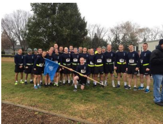
Cadets and Cadre just before stepping off on