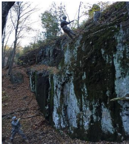
Cadets work together to rappel down a cliff face at South Mountain

LTX After a full night's sleep, Alpha Company woke up and conducted squad STX lanes, testing their ability to not only receive and understand an operations order, but also communicate the mission to their squad and lead them. After two full days of continuous training, Pirate Battalion moved back to FOB SHU and dismissed for the remainder of that weekend.