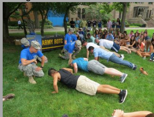
Cadets Critique Freshman push up from during Pirate Adventure