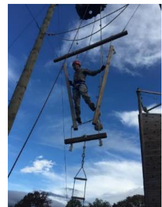
Cadet Duce maneuvers on the Columbia high ropes course