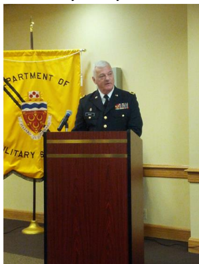
General Grant address the new Lt's