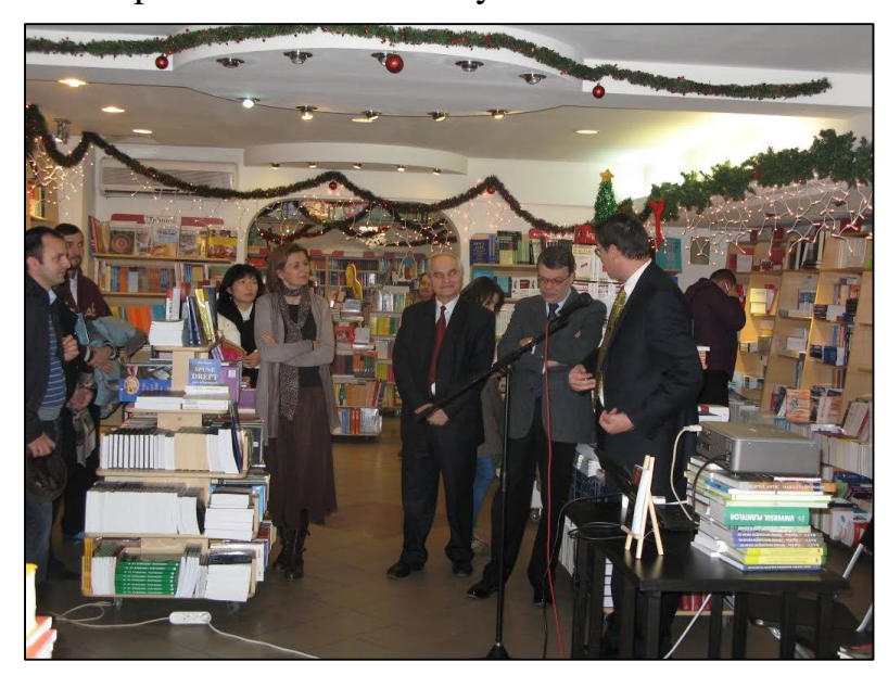
Book signing & presentation in Bucharest, Romania.

Additionally, during the spring, there was a trip to Romania, where I am on the Boards of two academic journals, for a book signing of the Romanian translation of Sacrilege and Redemption in Renaissance Florence . I happened to be there for the first of a series of night rallies that led to the fall of the Romanian government. A friend took a picture of me waving a large Romanian flag, which has led to suggestions that I personally may have been involved in these developments--but I assure you I was not there as an activist!