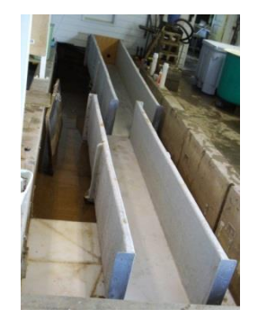
Hammond Bay Biological Station and building the raceway

The rest of the summer, we ran tests on the polymer emitters containing the dye. As far as release of dye was concerned, all three polymers (HEC, PVA, PEG)