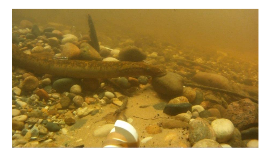
Lamprey on rock with emitter in foreground.

went to the blank first. This is a big difference, and it shows that the polymer emitters can successfully act as attractants for lamprey.