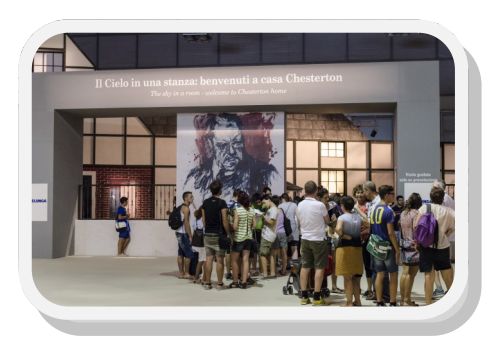
Chesterton Exhibit @ the 2013 Rimini Meeting Italy—August 2013