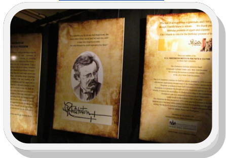
Exhibit: Chesterton & Freedom @ The New York Encounter—January 2013