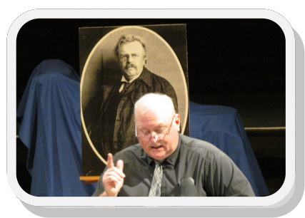
Saints & Sleuths Dramatic Reading of "The Club of Queer Trades" —Jan./Feb. 2013