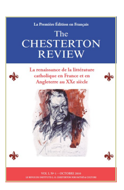
The Chesterton Review French—Vol. I