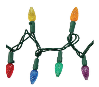
Garland, live Christmas trees, wreaths and holiday lights are prohibited.