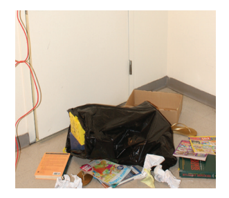
Egress (exit) path must be clear of obstruction at all times.