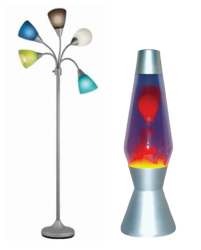
Multiple bulb lamps with plastic shades and lava lamps are prohibited.