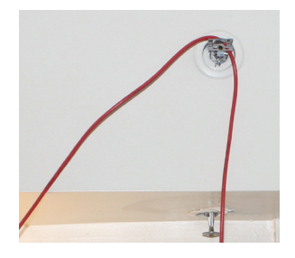
Hanging anything on or from a sprinkler head or water pipe compromises fire suppression systems.