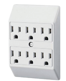
Multiple adapters of any type and plug-in air fresheners are prohibited.