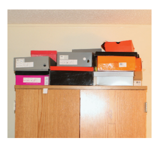
18-inch clearance from the ceiling is required for sprinklers to work properly. Nothing may be on top of wardrobes.

Visuals not intended to be all inclusive