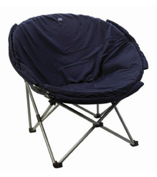
Upholstered furniture that does not meet California Technical Bulletin 133 is prohibited.