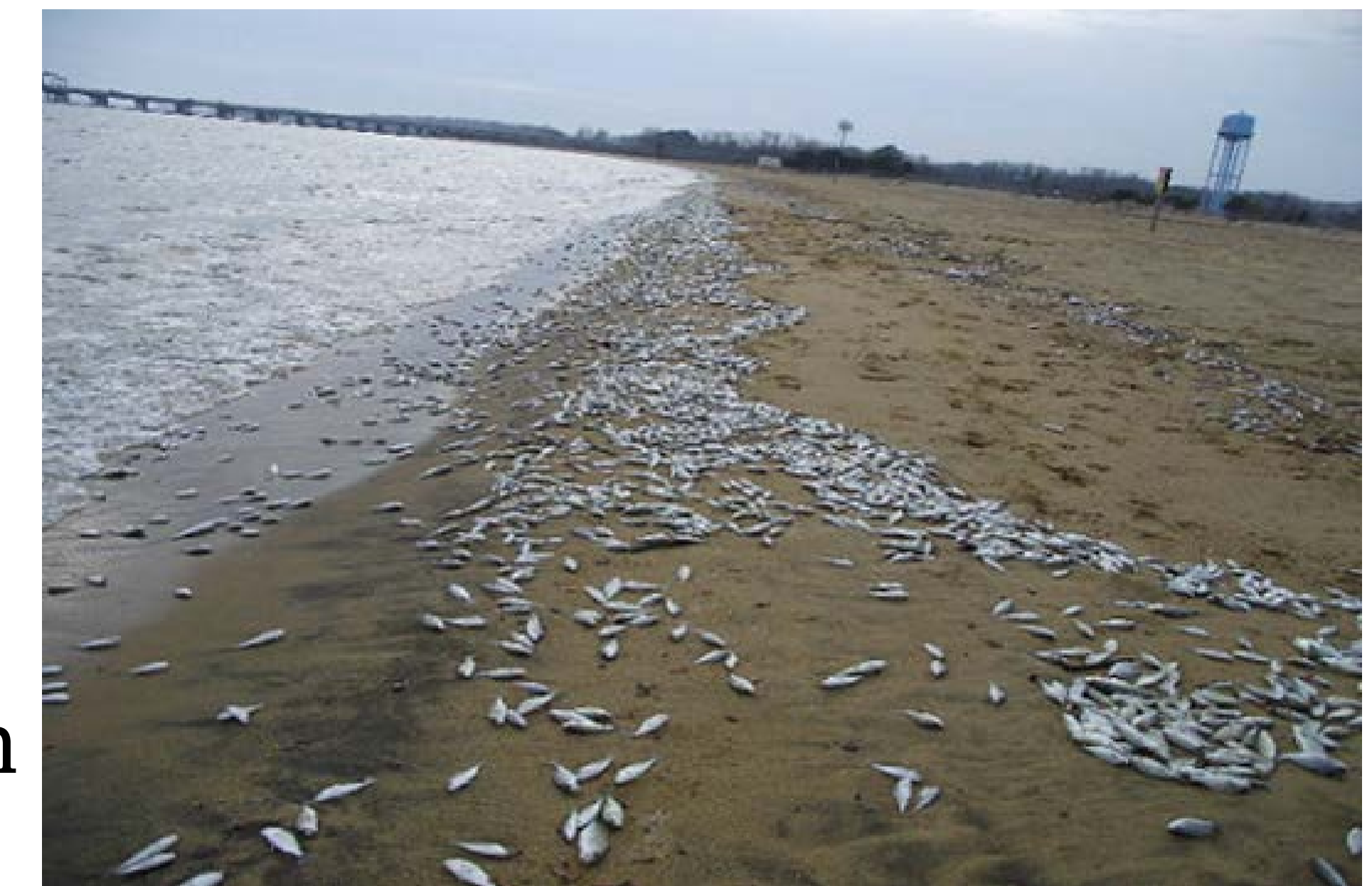
Maryland Department of the Environment-Maryland.gov