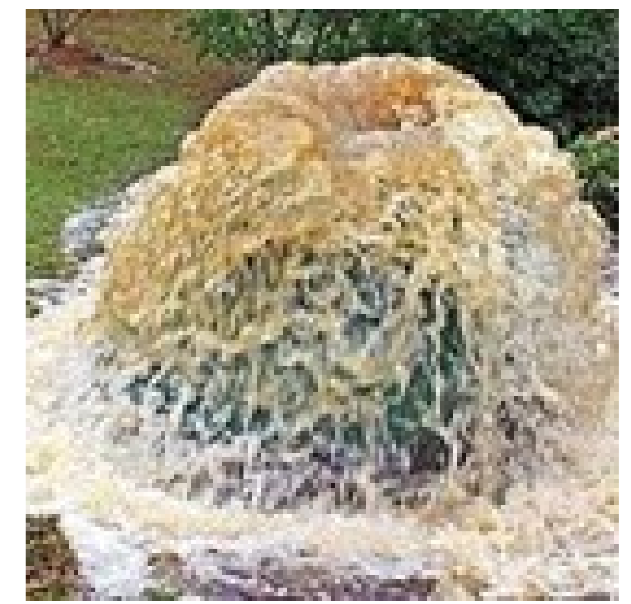
Sewage overflow USG.gov