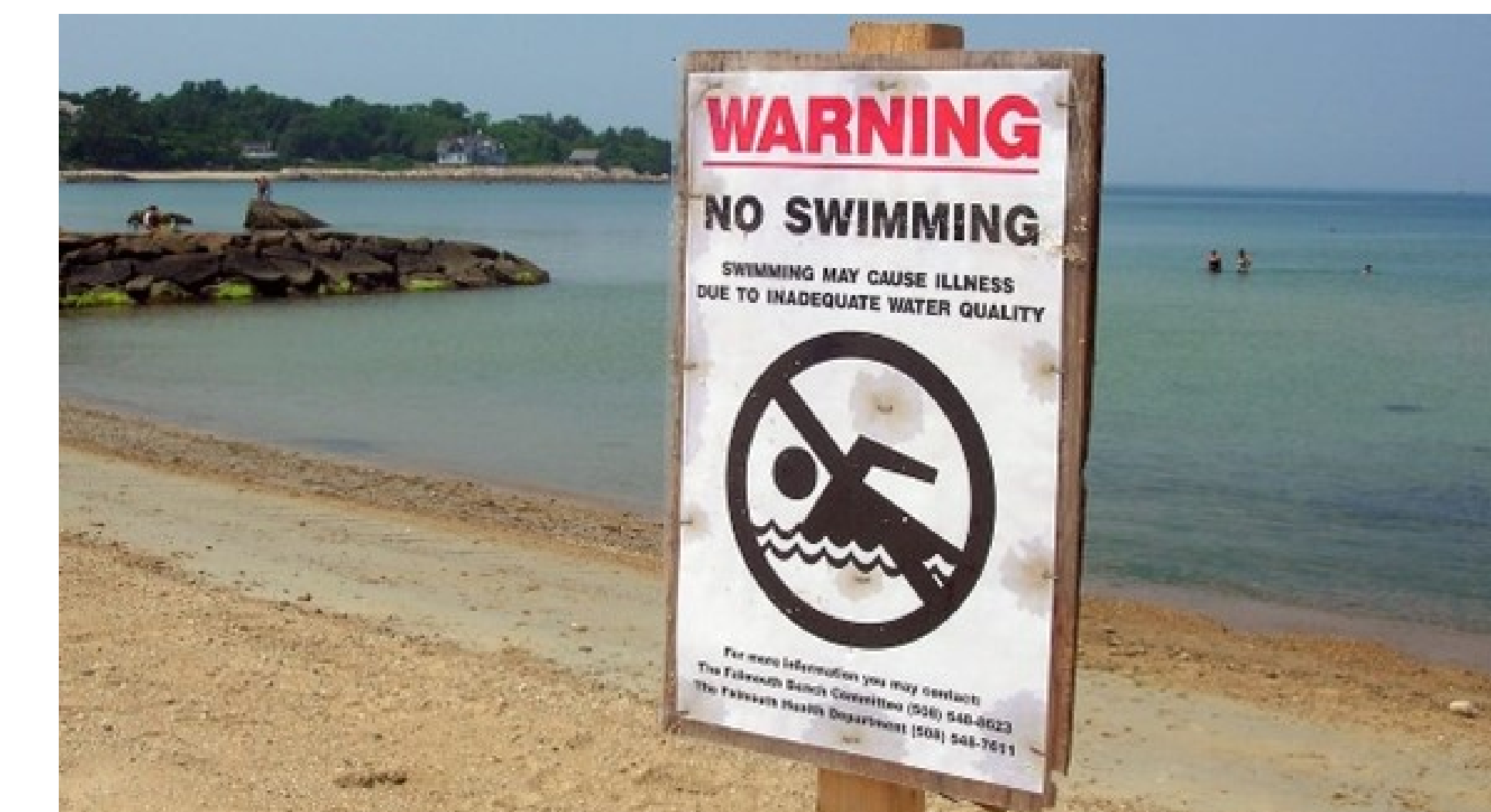
Woods Hole Oceanographic Institute