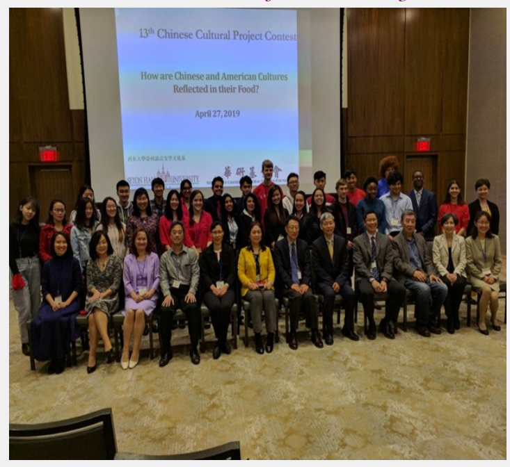
Chinese program in conjunction with NJCCSF organized The 13th Chinese Cultural Project Contest. It was held on April 27 in