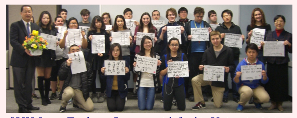
SHU Japan-Exchange Program with Sophia University 2016