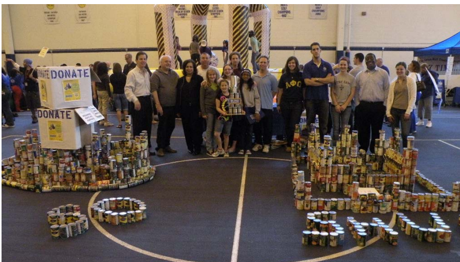
Above: Students and residents build can castles during this year's University Day. 1200 cans were collected by the two groups to benefit the Community Food Bank of New Jersey. Top Right: Students sort food during a recent Service on Saturdays (SOS) program. Bottom Right: A student reads to a child during Seton Stories at South Orange Public Library.

Seton Hall students are passionate about serving others. Given the opportunity, students are not only willing, but excited to lend a hand. The Division of Volunteer Efforts encourages community organizations to contact the office if they are interested in partnering with the University for student volunteers. Please e-mail divisionofvolunteerefforts@shu.edu or call (973) 761-9702 for more information.